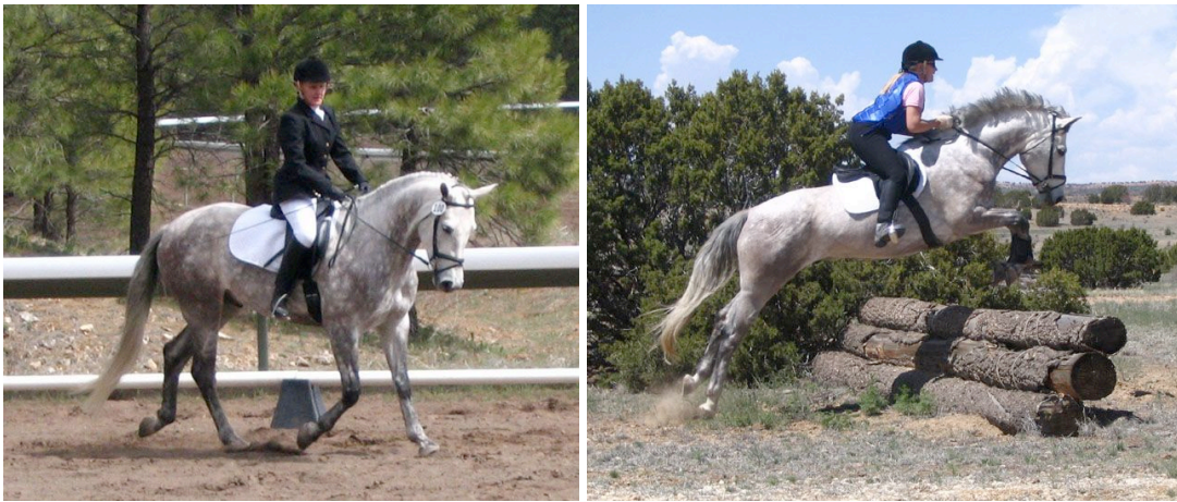
King Oberon OSF, a 5 year old Iberian Warmblood competing in dressage and eventing.

Current competitions are geared towards the rectangular horse and his ability to move forward covering a lot of ground. Training for competitions is also geared towards moving the horse forward and keeping him horizontal to the ground, such that his hindquarters drive him forward (rather than upward) and onto the bit. Competition horses are never asked to lower their croup and lift their forehand to the extent that is required to perform the advanced exercises of the classical school, such as the levade. With these being the current standards, the square horse is not given the opportunity to show his greatest capacity in competition. On the other hand, more and more dressage trainers and enthusiasts, recognize and value the square horse for what they can give to the rectangular horse and its rider.