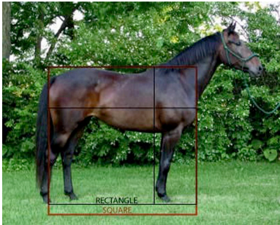
Dutch Warmblood mare showing rectangular conformation as well as many characteristics of the “Old Iberian Factor” including high set neck, sub-convex head, thick mane and tail, and strong, sloping croup.

mount, but rather seeked a fast horse that would race and hunt over fences. The classical art of dressage as performed with the Iberian horse became obscure, except on the Iberian Peninsula and in some of military schools, where it can still be found today.