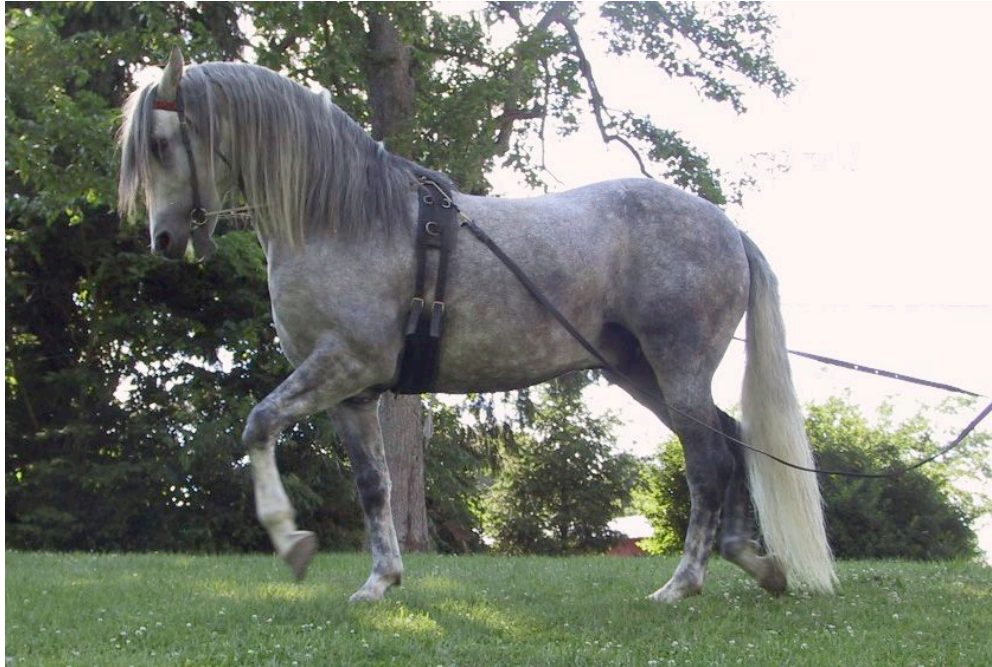
Pure Spanish stallion working in long lines.